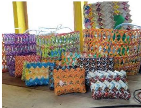
Figure 6. Craftsmen's Handicrafts

Items that can be recycled are processed at the hands of craftsmen or PKK mothers who have been fostered by the BNM waste bank. The craftsmen make various kinds of inorganic waste. The following types of BNM waste products: