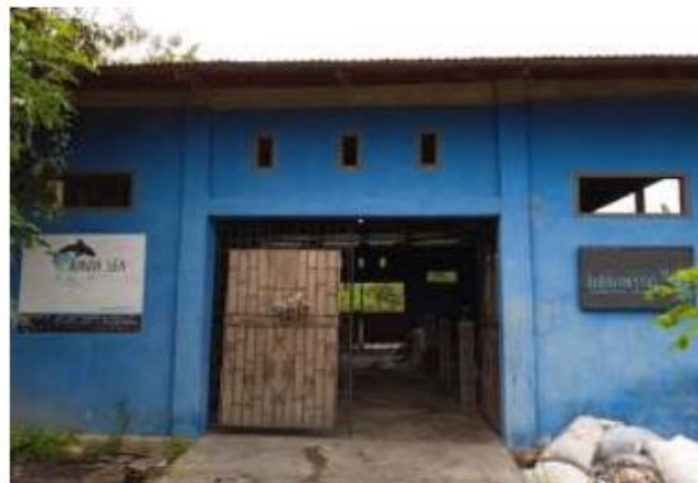
Figure 3. Recycling building

In 2019, a recycling building was built, which was a donation from the large company Tirta Foundation PT. Aqua Danone by Mrs. Tirta and Luminocean and sponsored by BandaSEA from Germany. Since then, the activities of the waste bank have become more widespread, namely collecting waste in all other villages and islands in Banda Naira. Banda is a very remote island; it consists of several clusters of small and distant islands and is very difficult to reach.