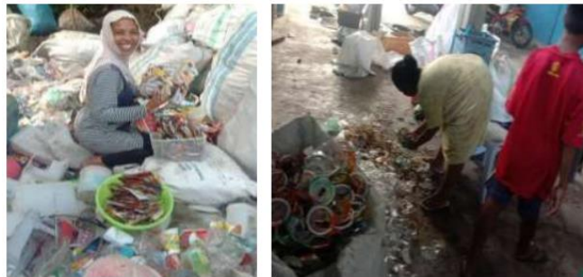
Figure 4. The process of collecting waste for recycling

Together with German partner BandaSEA e.V., the waste bank collection activity has carried out a number of positive activities aimed at creating a waste-free sea and Banda island, becoming an environmental education center for children on Banda Island, and even co-funding the first "green school" in Banda that is free of single-use plastics. At that school, children learn a responsible way of handling and reducing plastic waste.