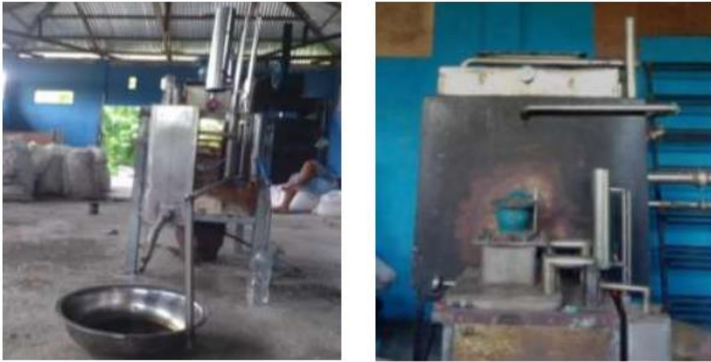
Figure 7. Pyrolysis Machine for Processing Plastics into Fuel with Capacity of 10 and 50 kg

BNM has also set up an environmental education center for children on Hatta Island. This non-profit project contributes to the future of marine conservation in the Banda Islands. They also funded the first green school in Banda, which is free of single-use plastics. Here, children learn how to be responsible when handling and reducing plastic waste.