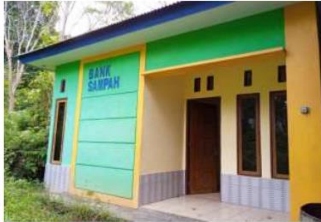
Figure 2. Waste Bank Building

In 2019, a recycling building was built, which was a donation from the large company Tirta Foundation PT. Aqua Danone by Mrs. Tirta and Luminocean and sponsored by BandaSEA from Germany. Since then, the activities of the waste bank have become more widespread, namely collecting waste in all other villages and islands in Banda Naira. Banda is a very remote island; it consists of several clusters of small and distant islands and is very difficult to reach.