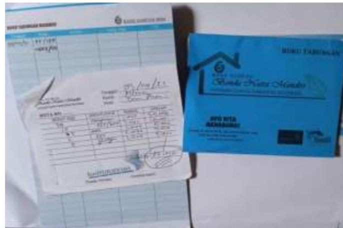
Figure 5. BNM Waste bank Bank Savings Book

The process of saving in a waste bank begins with sorting the waste by the customer himself, namely by separating organic waste according to type and code. Each customer is given a savings book for those who want to save at the BNM waste bank. Officers weigh and record the amount of waste that has been sorted by customers based on the weight of the waste. Waste bank that has been weighed will be transported by officers directly to the building where plastic is recycled.