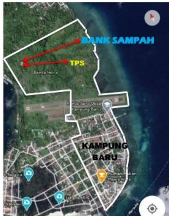
Figure 1. Location Map of the Trash Bank's Existence

This article is based on the results of qualitative descriptive research. According to David Williams (1995), as quoted by Maleong (2007: 5), qualitative research is collecting data in a natural setting, using natural methods, and carried out by people and researchers who are naturally interested. The research was conducted in Kampung Baru Village, Banda Naira District.