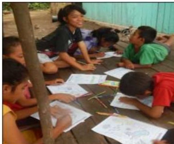
Figure 8. Green School

BNM has also set up an environmental education center for children on Hatta Island. This non-profit project contributes to the future of marine conservation in the Banda Islands. They also funded the first green school in Banda, which is free of single-use plastics. Here, children learn how to be responsible when handling and reducing plastic waste.